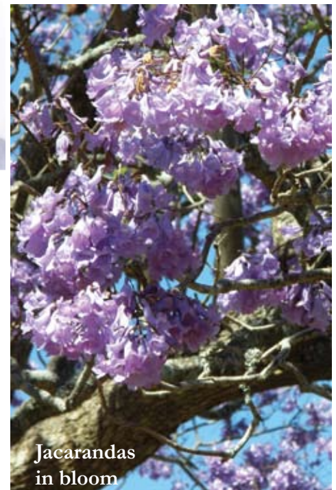
Jacarandas in bloom