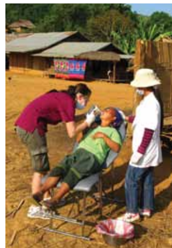
Houay Kong – a village in the district

Each year we take two third year dental students along as part of their undergraduate course. They usually find this