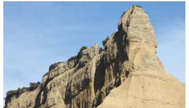
The Sphinx above North Beach, Gallipoli